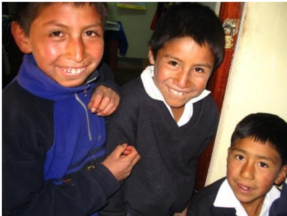
picture 4- Shining faces of mountain kids who have just received the best Christmas gift of all!!! Gods gift of eternal life through Jesus.